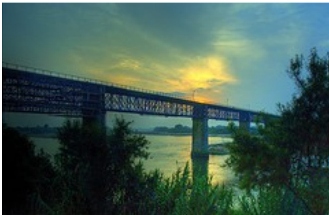
Sun rising over the Dom Luis Bridge

This image of the sun, rising over the bridge epitomizes what I am coming to learn and understand about education, and also what I strive to do as an educator.